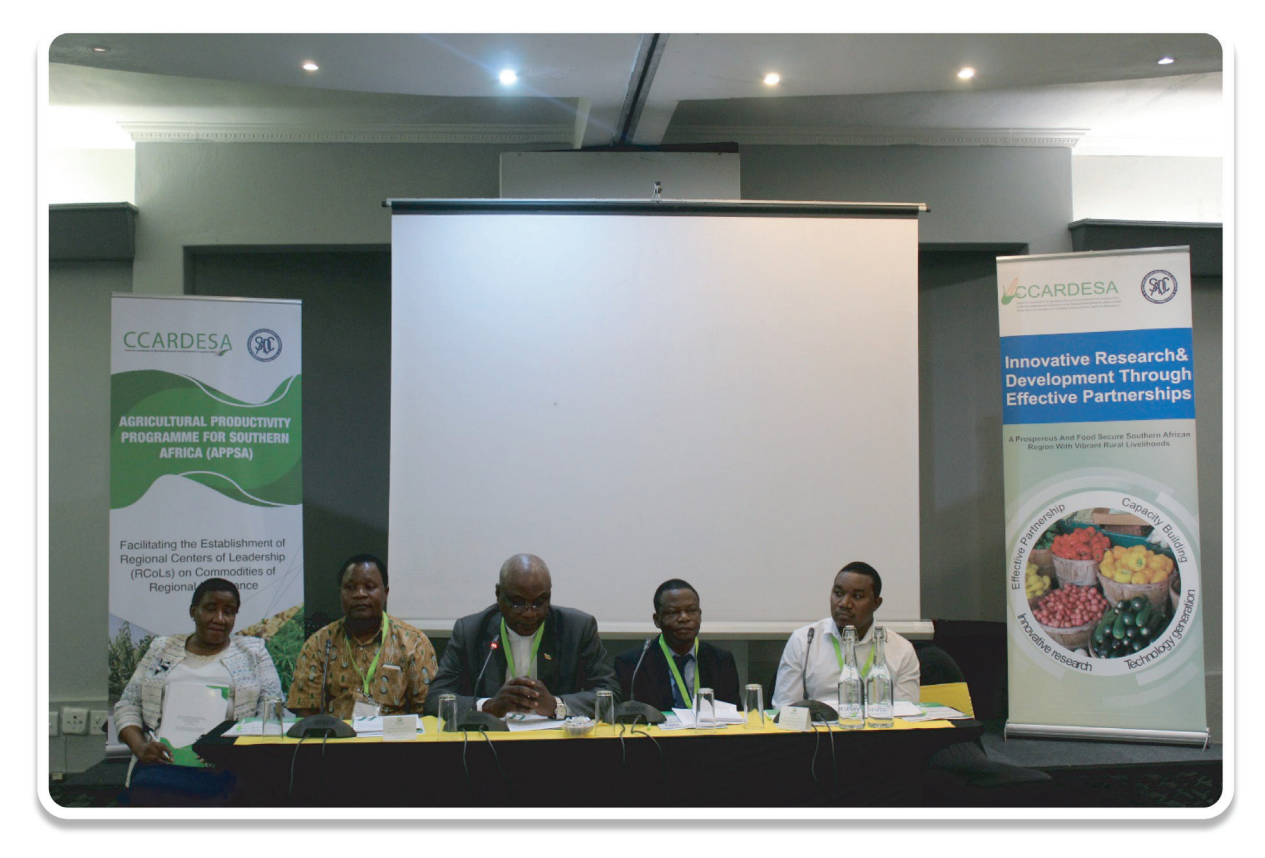
The officials who gave remarks at the opening session and on the far left is the Board Chair who gave the official opening speech at the Conference.