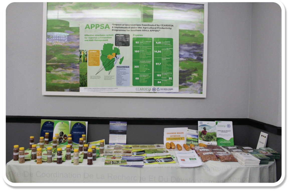
Diplay of key outputs from the APPSA RCoL