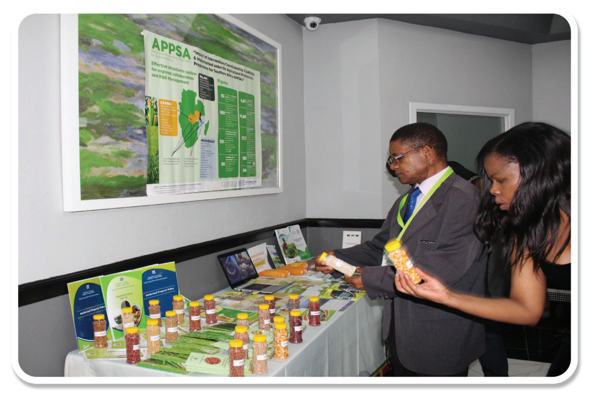
Diplay of key outputs from the APPSA RCoL